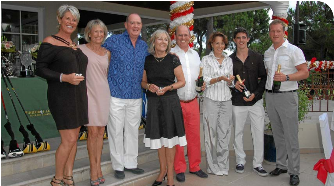
Nearest the Pin winners