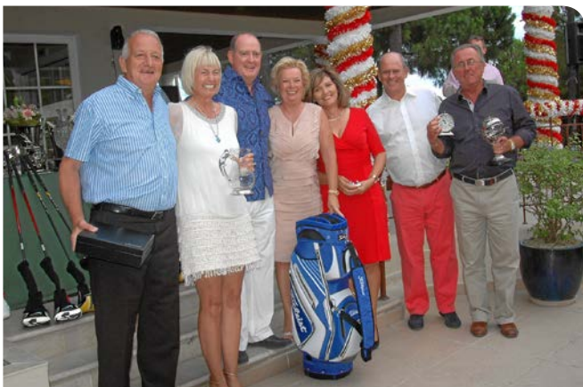
Greensome prize winners