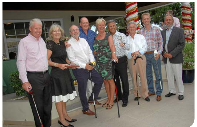
American Foursomes prize winners