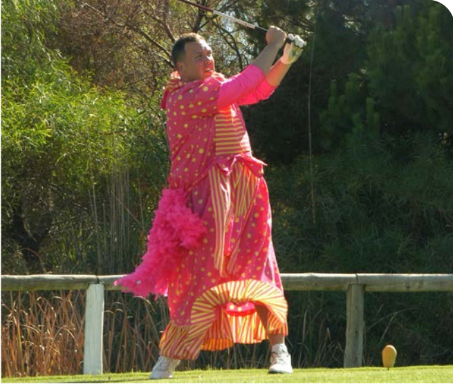
Anastasia Tremaine swing