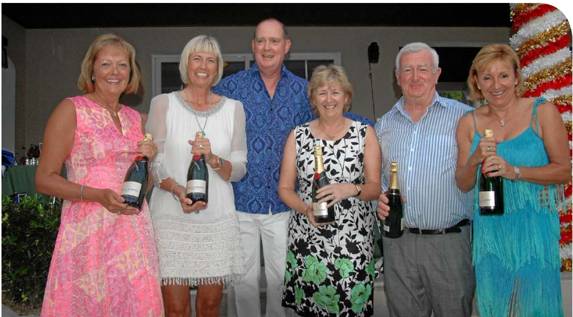
The Shoot Out best dressed winners

It only remains for me to wish you all a good start to the golfing season in the Algarve. I look forward to seeing you all at the various competitions and events over the next few months.